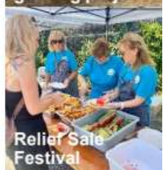
Relief Sale Festival