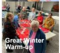
Great Winter Warm-up