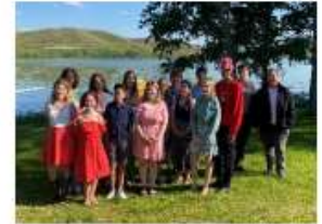
Some members of Camp Elim Staff, 2024

We are grateful to all of the people who continue to generously support Camp Elim through prayer, service, and/or finances.