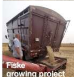
Fiske growing project