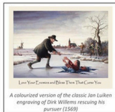
A coloured version of the classic Jan Luiken engraving of Dirk Willems rescuing his pursuer (1569)