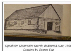
Eigenheim Mennonite church, dedicated June, 1896. Drawing by George Epp